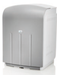
Soundproofing for V/VS/VSA 300 S