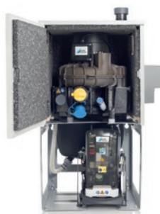
Soundproofing for V/VS 600-1200 S