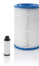
Outlet air virus/bacteria filter