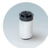
Coalescence filter for membrane drying unit

DÜRR DENTAL SE Höpfigheimer Str. 17 74321 Bietigheim-Bissingen Germany More information under www.duerdental.com info@duerrdental.com