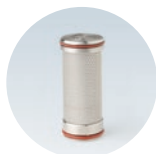
Bacteria filter for membrane drying unit