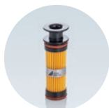
Air intake filter for compressor units

Filter finder overview website: https://www.duerdental.com/en/products/compressed-air/materials-and-accessories/filter-finder/